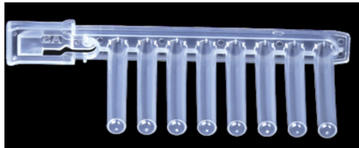
Fig.1 Magnetic Rod Tip for Insta NX® Mag16