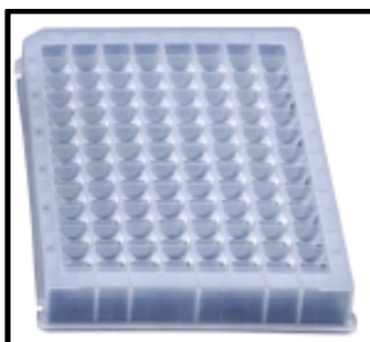
Fig.1 96 Elution Plate for Insta NX ® Mag96