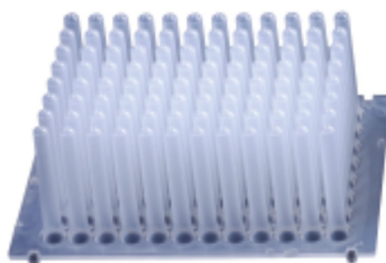
Fig.1 Magnetic Tip Comb for Insta NX ® Mag96