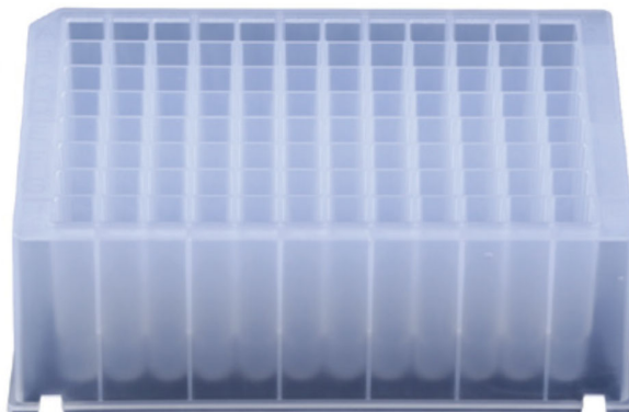
Fig.1 96 Deep Well Plate for Insta NX ® Mag32