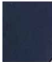
Negative Results (With distilled water)