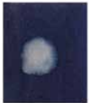
Positive Results (With known Saliva)