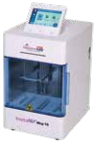
InstaNX ® Mag16 (LA1118)