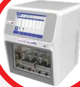
InstaNX ® Mag32 PRO (LA1121)