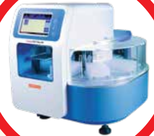
InstaNX ® Mag96 (LA1097)