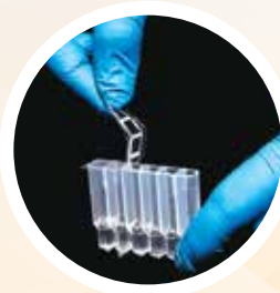
Peel-off Pre-filled Cartridge