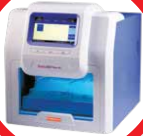
InstaNX ® Mag32 (LA1096)