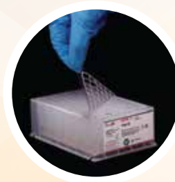
Peel-off Pre-filled Plates