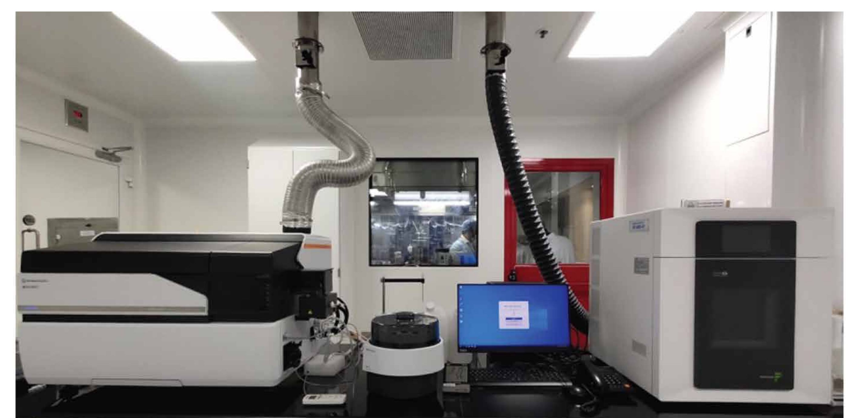
ICPMS with Digestor