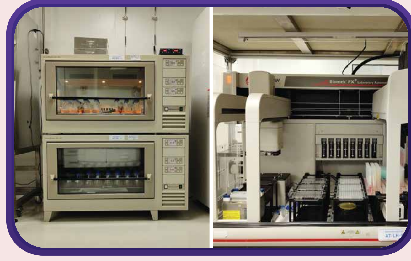
Scale I High-throughput screening with Robotic Liquid Handling System