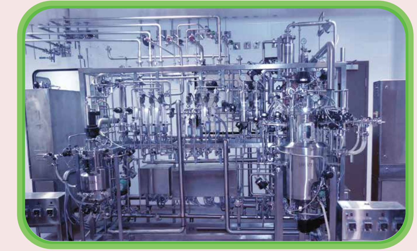
Scale V Pilot Scale Plant In-situ Sterilizable Bioreactor System in 50L Bioreactors