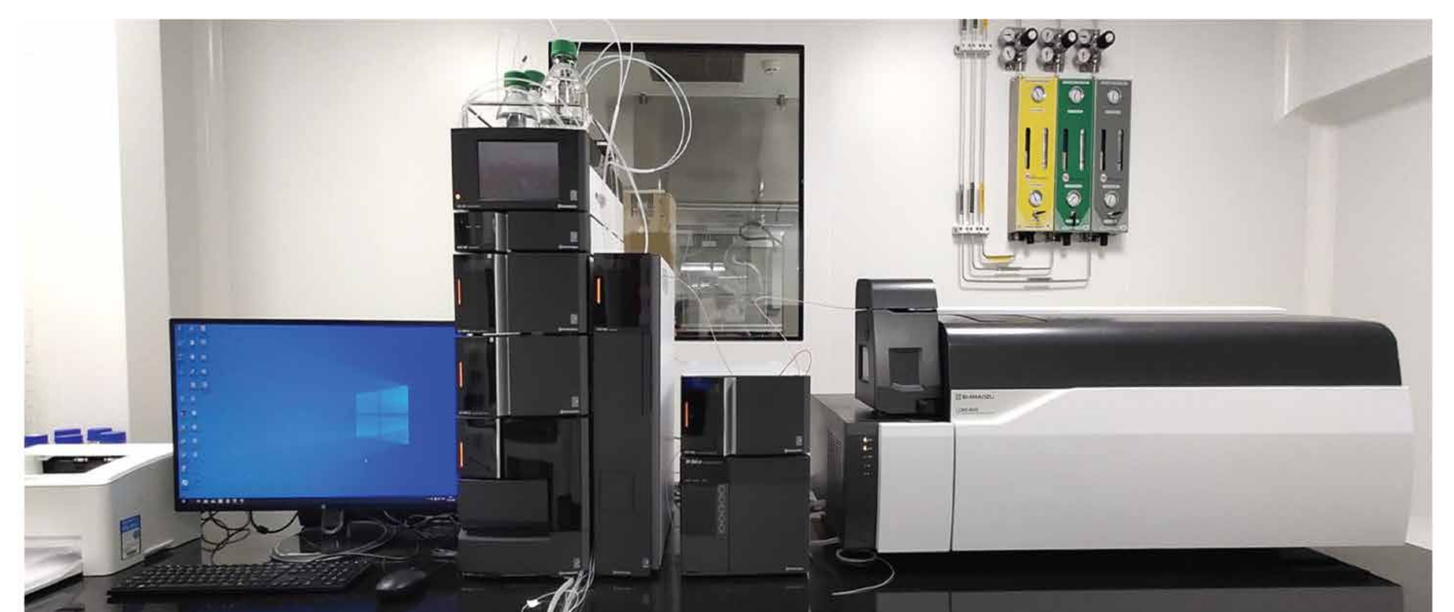
UHPLC & LCMS 8045