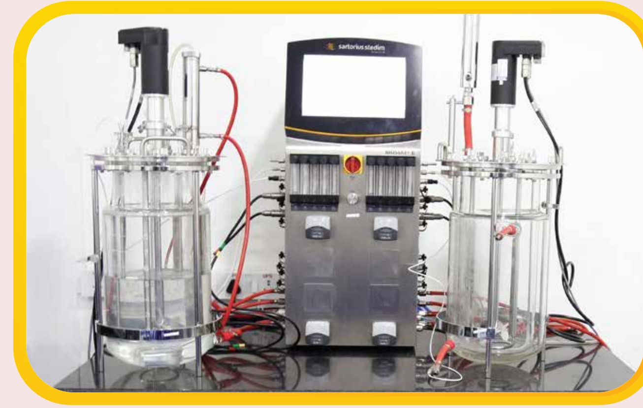
Scale IV Complete Process Optimization in 10L Bioreactors