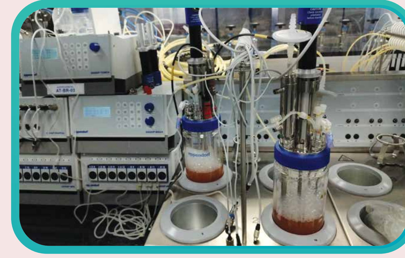
Scale II Media optimization in 1.5L Bioreactors